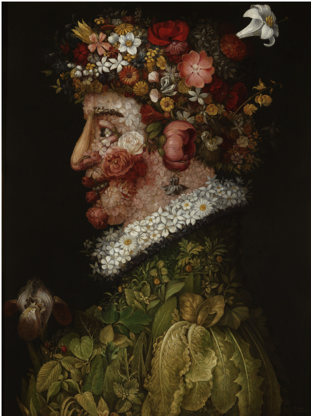
Figure 1. Portrait of a Mythical Figure Arising from Plant Leaves and Flowers: La Primavera by Giuseppe Arcimboldo, 1563, Real Academia de Bellas Artes de San Fernando, Madrid. Reproduced with permission.