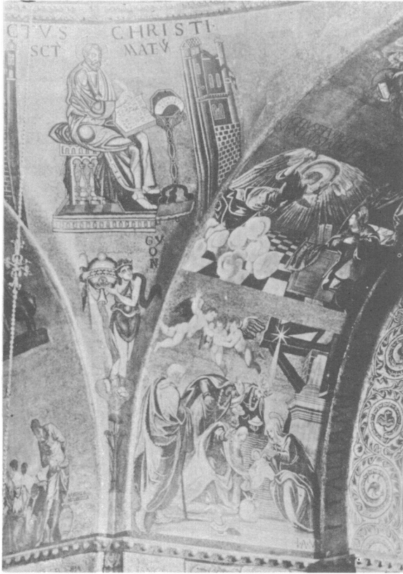
FIGURE 1. One of the four spandrels of St Mark's; seated evangelist above, personification of river below.

The design is so elaborate, harmonious and purposeful that we are tempted to view it as the starting point of any analysis, as the cause in some sense of the surrounding architecture. But this would invert the proper path of analysis. The