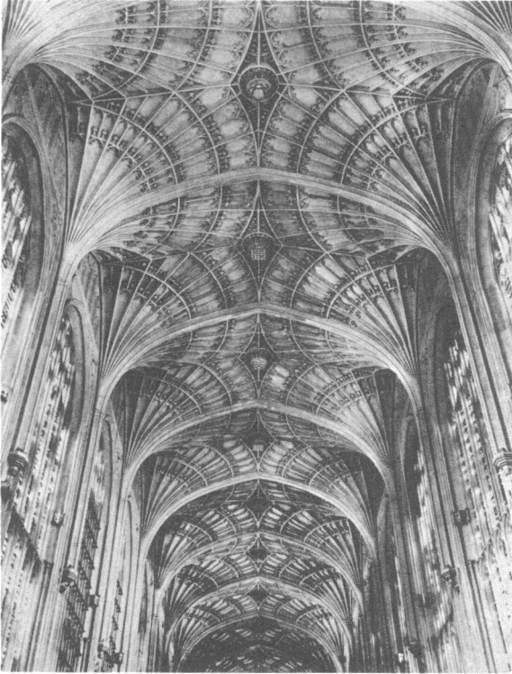
FIGURE 2. The ceiling of King's College Chapel.

the Tudor rose and portcullis. In a sense, this design represents an 'adaptation', but the architectural constraint is clearly primary. The spaces arise as a necessary by-product of fan vaulting; their appropriate use is a secondary effect. Anyone who tried to argue that the structure exists because the alternation of rose and portcullis makes so much sense in a Tudor chapel would be inviting the same ridicule that Voltaire heaped on Dr Pangloss: 'Things cannot be other than they